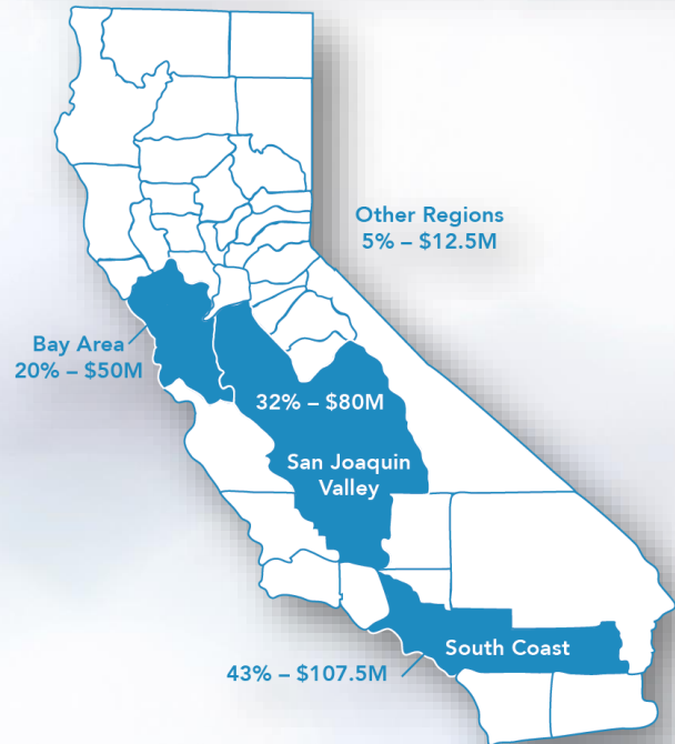
CLEAN TECHNOLOGY INCENTIVES – $250 MILLION