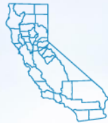
LOCAL AIR DISTRICTS